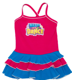
TUTU FRILL DRESS $45