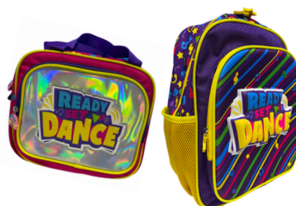
BAGS from $30

We also stock a range of READY SET DANCE merchandise that makes a perfect gift for an eager young dancer! - Available from reception.