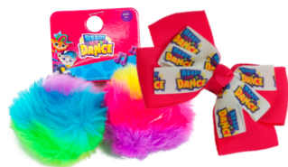
HAIR ACCESSORIES from $8