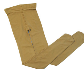
STOCKINGS- tan or ballet pink $15