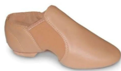
JAZZ SHOES- black available for boys $58