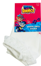
FRILL SOCKS $6