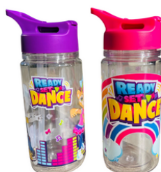
DRINK BOTTLES $12.95