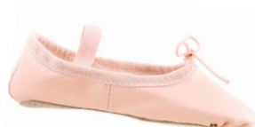
BALLET SHOES- black available for boys From $35