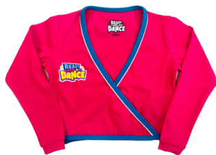
CROSS OVER $40